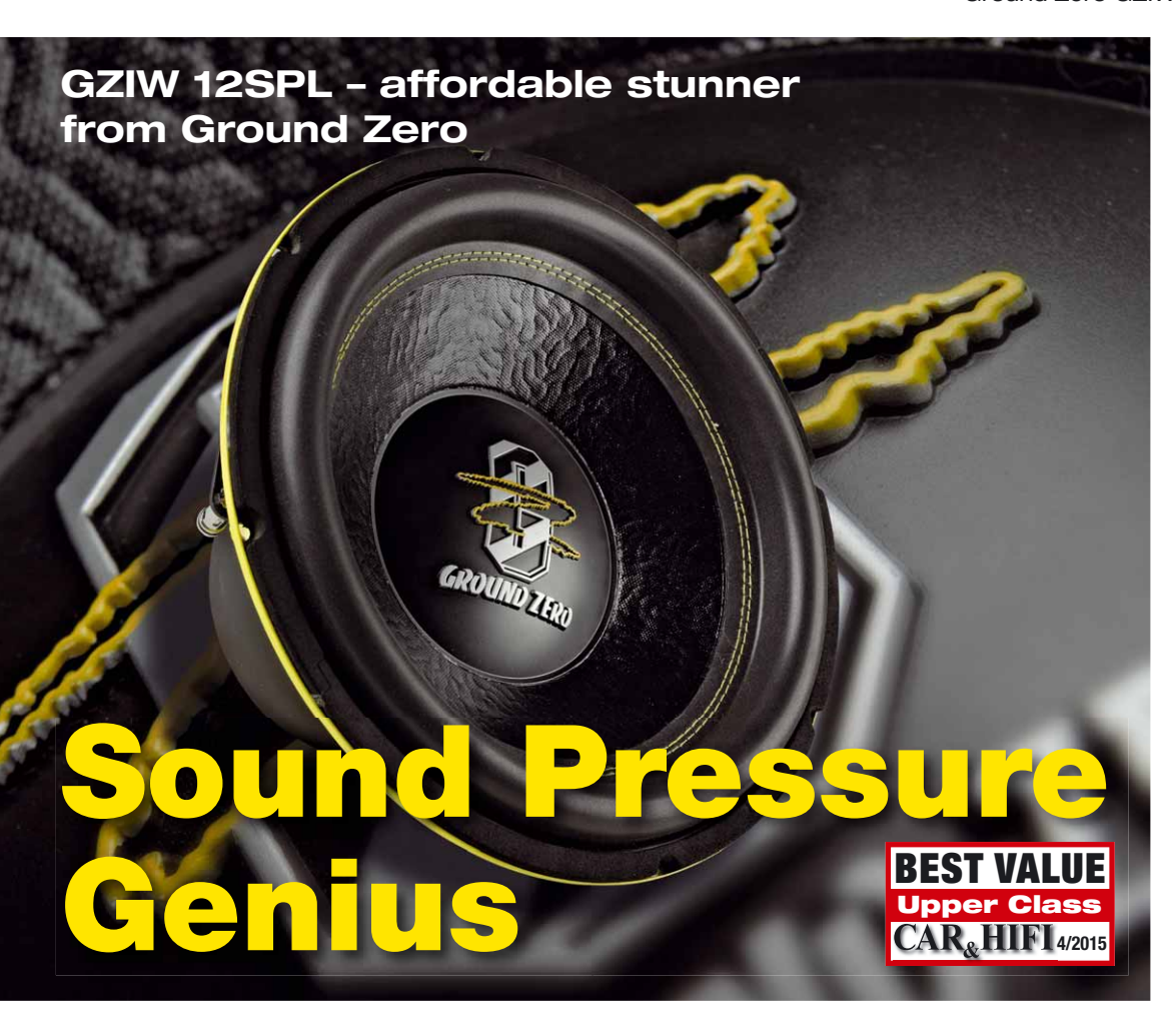
With the GZIW 12SPL. Ground Zero presents a woofer within the affordable Iridium range, but with the appendix SPL. We clarify the contradiction.

S^{\text{PL}} woofers usually are heavy hunks – and they're almost always guite costly. The GZIW 12SPL can be purchased for less than USD 180; about the fourteenth part of the asking price of their SPL flagship Plutonium GZPW 15SPL-Extreme. This should make clear that the GZIW 12SPL is not meant for setting up new world records, but it should always be good enough for some serious sound pressure fun. Its cone is made from half-pressed paper and has a very steep cone angle, which delivers stability. We can even find a 64 mm (2.5") voice coil with the respective power handling capacity. Additionally the construction offers plenty of mechanical stroke reserves as well as outstanding electrical stroke with a 10 mm (0.4") voice coil overhang. The design is practice-oriented with a free air